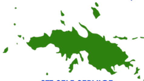
STJ SELF SERVICE

Regular Fuel: $4.303 Premium Fuel: $4.638 Diesel Fuel: $5.064