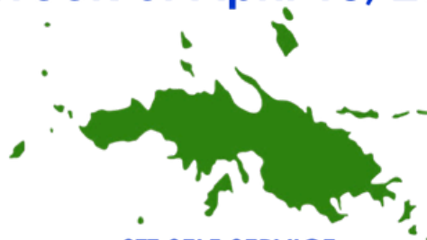
STT SELF SERVICE

Regular Fuel: $4.388 Premium Fuel: $4.731 Diesel Fuel: $5.185