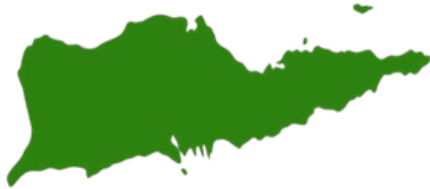
STX SELF SERVICE