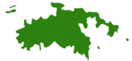
STJ SELF SERVICE

Regular Fuel: $4.775 Premium Fuel: $5.336 Diesel Fuel: $5.886