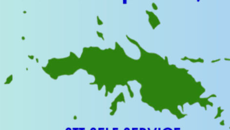
STT SELF SERVICE

Regular Fuel: $4.422 Premium Fuel: $4.666 Diesel Fuel: $5.163