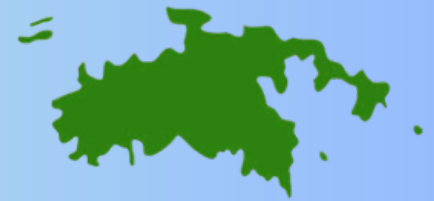
STJ SELF SERVICE

Regular Fuel: $5.157 Premium Fuel: $5.762 Diesel Fuel: $6.540