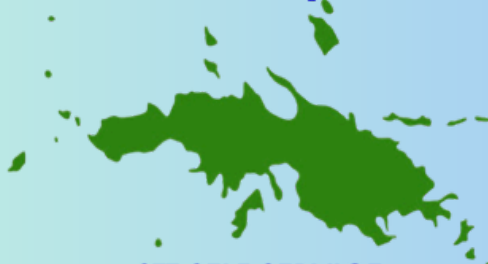
STT SELF SERVICE