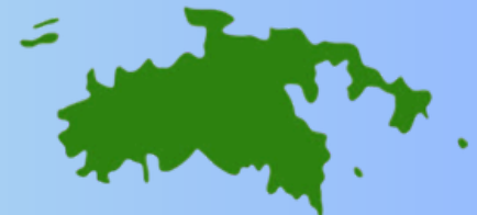
STJ SELF SERVICE