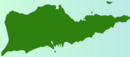
STX SELF SERVICE