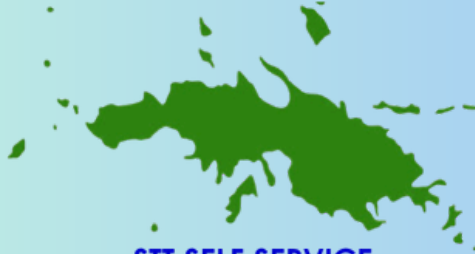
STT SELF SERVICE